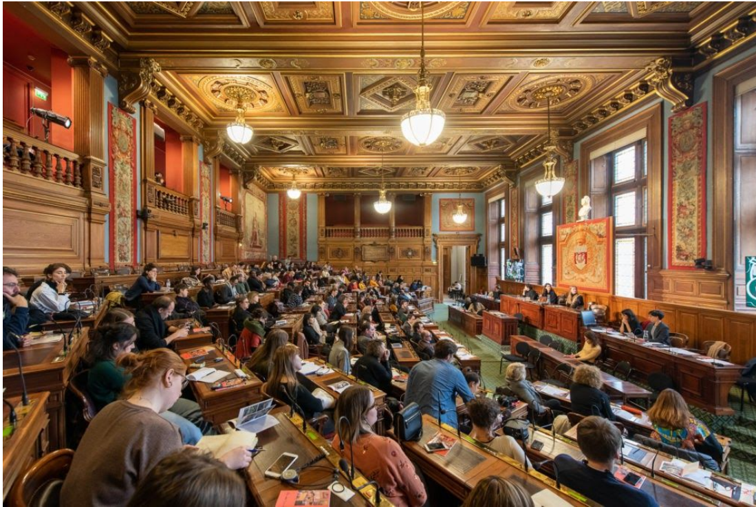
@ Visible Award 2019, Temporary Parliament - Hôtel de Ville, Paris

The Masterproject in Art, Design and Image in a Socio-Political Context invites you to explore art and design in the social and political sphere. Explicitly or not, as an image-maker, your personal or collective practice is inseparable from the social and political contexts it is operating in. Moreover, your socially engaged work also can give thought to, inspire or truly enable to transform these contexts. Through in-depth coaching both from internal and external experts, you develop an intuition on what it means to create work in relation to your societal concerns that could be qualified by terms as climate crisis, solidarity crisis, alternative economies, (de)colonialism, feminisms, commons, queer cultures, just to name a few. You develop a personal or collective method, via intensive immersion into relevant professional contexts and by orienting further upon the historical practices of social design, socially engaged art, community art, activism, ecological and decolonial imaginaries, relational aesthetics, and so on (which is in itself building further upon predecessors such as a.o. Situationism, Tropicalia, Happenings, Fluxus and Dadaism). Together with your student peers, you engage in a horizontal learning environment in which the sharing of empowering tools and thoughts is invested in practices that consider process and methodology equally important as artistic and aesthetic values.